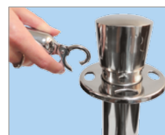
Ropes feature quick and easy 'clip-in' attachment