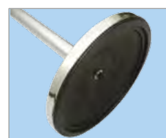
14.4kg stanchions with 360mm diameter bases for optimum stability