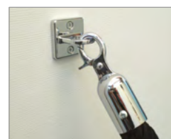
Chrome plated 'Eye Plate' available for wall mounting